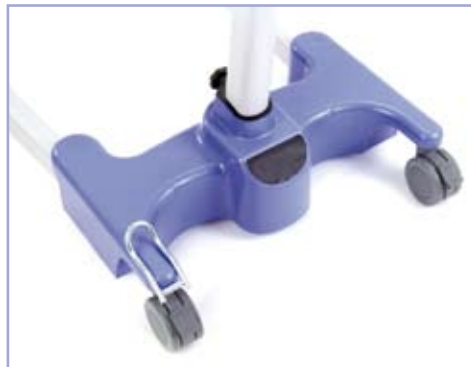
Ergonomic foot push pad