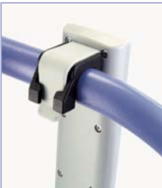
Convenient hand control rest