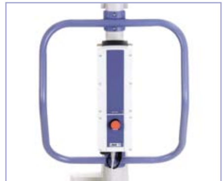
Ergonomic oversized push handle