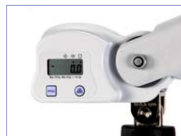
Digital weigh-scale (Class III)

One of the restrictions of using certain lifts is the type of slings you can use on the product. The Presence, however, gives you a choice of sling systems because you can use the conventional 6-point spreader bar (A) or Oxford 4-point positioning cradle (B - powered version shown).